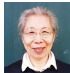
Student from the Korean Peninsula, in her 70s (current student)

I was not able to study at school because of the war. Studies should be done when people are young. People who are afforded the opportunity to study now should learn so they have no regrets.