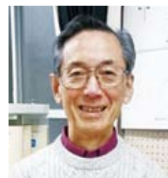
Student from Japan, in his 80s (current student)

If you are debating whether or not to enroll, I would recommend that you do not hesitate and enroll immediately. School is quite fun, with people from many different countries, and even if you are older, you will feel like you are in the prime of life.