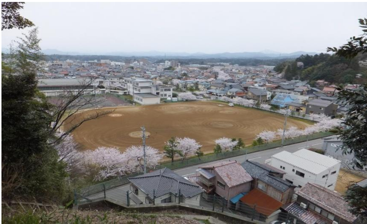
Our School ground seen from Mt. Kinjozan

For example, we have Daishoji-Fukuda-machi, Daishoji-Uwagi-machi and Daishoji-Hata-machi. They say that these three towns were named after famous generals. The town where my school is, Daishoji-Baba-machi, was a place for the soldiers to practice riding on horses.