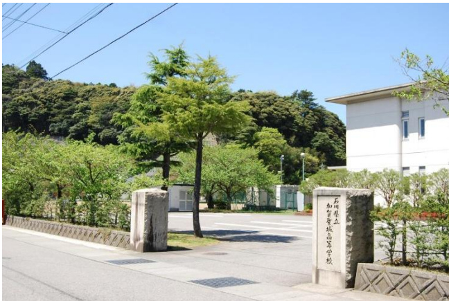
My school "Kagaseijo" and Mt. Kinjozan

First, I'd like to introduce my school. It is in Daishoji-Baba-machi, and the nearest station is Daishoji Station.